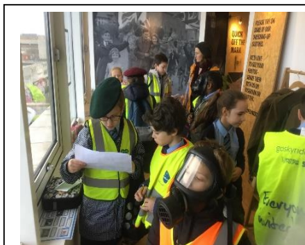
Upper key stage 2 enjoying 'Museum on Tour' on last week's trip.

Next Friday 9 th February is a Non- Pupil Day.