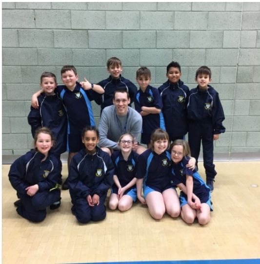
Year 4 pupils taking part in an Indoor Athletics Tournament at Plymouth Life Centre this Wednesday.