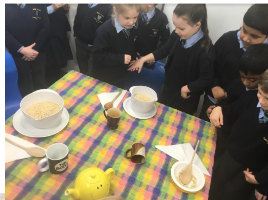
CRIME SCENE DAY